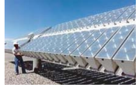
An array of solar photovoltaic (PV) panels

Solar Photovoltaics (PV) convert the sun's energy directly into electricity. Most solar PV cells are made of thin silicon wafers and are approximately 16-18% efficient at converting the sun's energy to electricity. Solar PV is used in a range of both off- and on grid applications and is easily scalable.