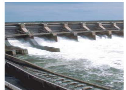
Impoundment hydropower technology at work in a traditional dam

Hydropower captures the energy of flowing water to produce electricity, and is the most widely-used renewable energy technology. There are a variety of hydropower technologies, but the most common is impoundment hydropower, which uses a dam to store and release water. This technology does have an impact on the local environment. Other, lower impact hydropower technologies are in use, but they generally provide electricity on a smaller scale. Electricity produced by large hydropower costs about $0.0085 per kilowatt-hour 1 , considerably less than nuclear, coal, and natural gas production. Many of the large hydropower sites in the United States have already been utilized, so there are few opportunities to create new capacity. The smaller, lower impact hydropower technologies have the most opportunity for growth.