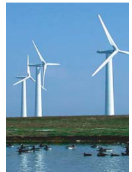
Three wind turbines - part of a larger group, or wind farm

Wind turbines convert wind energy into electricity. Wind power is the fastest growing electricity source in the world, and utilities throughout the U.S. are installing wind farms (see photo) for additional power generation. Large turbines can be up to 180 meters tall and produce 1.5 to 5 megawatts of power. (By comparison, the average household light bulb requires 60-100 watts). Small turbines are also available to provide power for homes or remote locations. Wind turbines can be sited and installed faster than many conventional power plants, and technology advancements are making it possible to generate electricity from low wind speeds. Also, despite a common misperception about turbines' impact on avian populations, they account for a fraction of 1% of bird fatalities caused by human influences (the two major contributors being buildings and domestic cats).